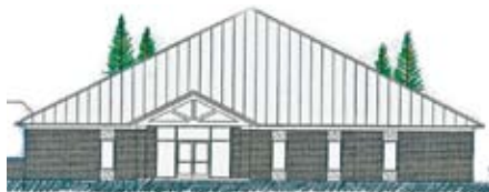
KINARD DINING HALL EXTERIOR RENOVATION

With our new "phased approach" we will be completing renovations in stages. PHASE ONE is anticipated to begin Winter 2009. Here is an overview of our plans: